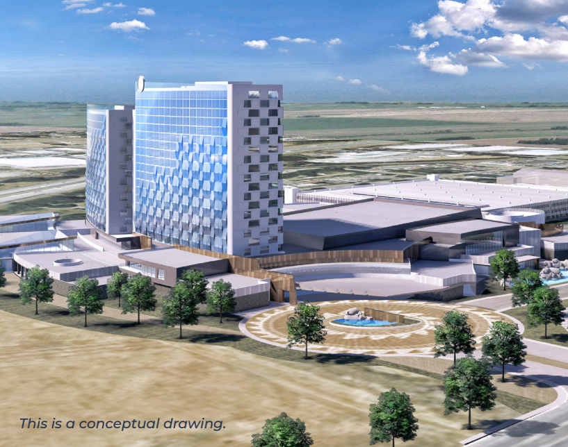
This is a conceptual drawing.